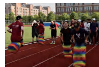
IMBA Fun Games