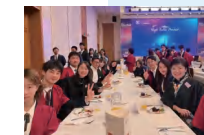
High Table Dinner