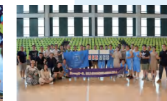
Zhejiang Major League Basketball Game