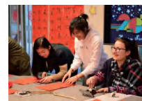
Chinese New Year Calligraphy Class