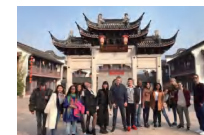
Visit the Nanguanxiang